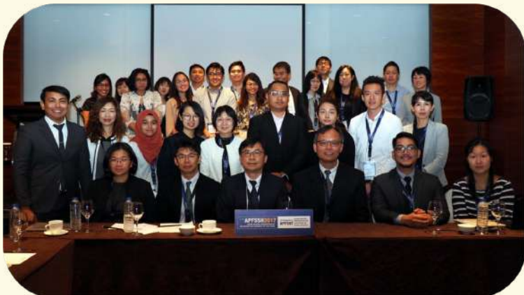
APFSHT Executive Committee Group Photo @ Cebu 2017