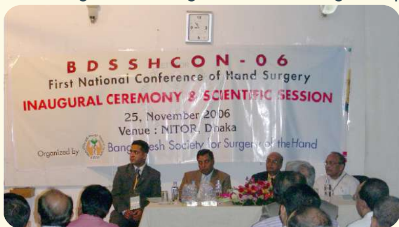
BDSSHCON-06, NITOR, 25 Nov 2006