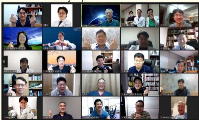
1st KSSH Webinar Symposium 2021

The number of attendees were more than we expected, reflecting the desire to continue learning and sharing knowledge in hand surgery. We found this platform was welcomed by our younger members who appreciated the time and energy saved compared to in-person meetings. We are planning to continue this bimonthly webinar.