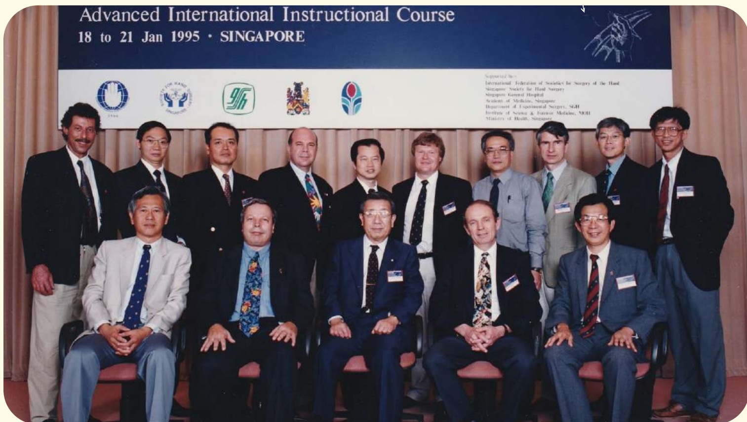
International Faculty with SGH Team @ Advanced Instructional Course, January 1995