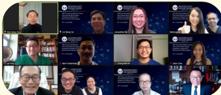
Faculty and Participants @ SSHS Virtual Meeting January 2021