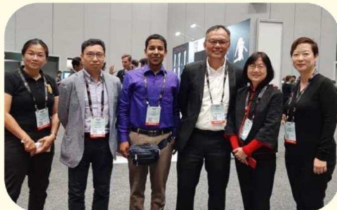
Hand Therapist Delegates from Hong Kong, Singapore, Malaysia and Bangladesh @ Melbourne 2020